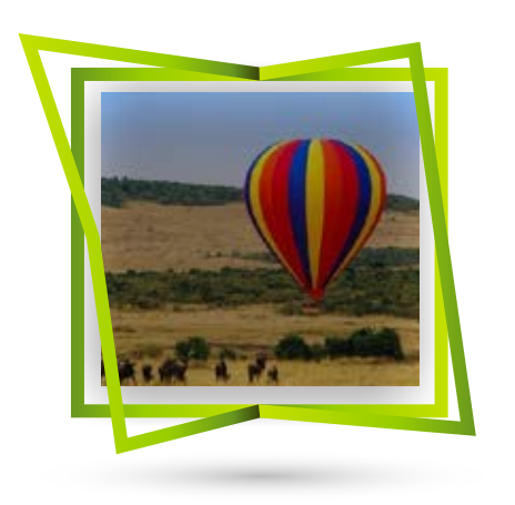
Hot Air Balloon Safari