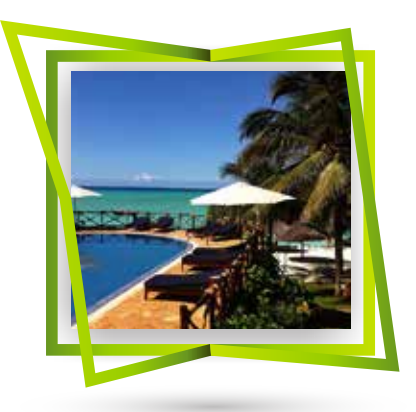
Zanzibar Beach Holiday