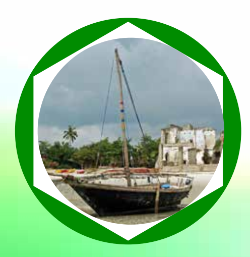
Stone Town Zanzibar