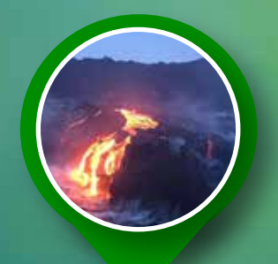
4. RWANDA DESTINATIONS