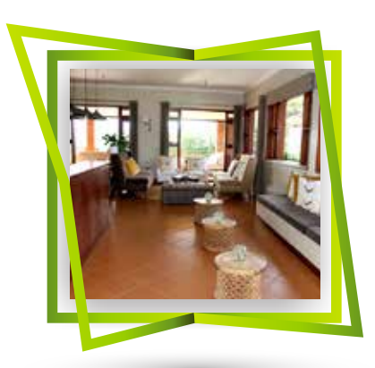
Luxury Lodge Safari