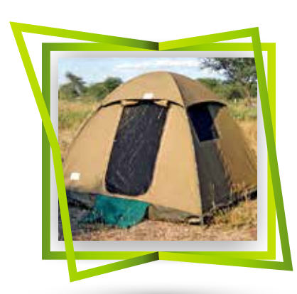
Budget Camping Safari